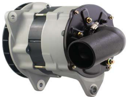
with optional 90° elbow